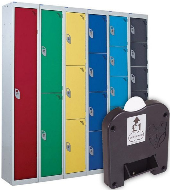
Coin Return Lockers